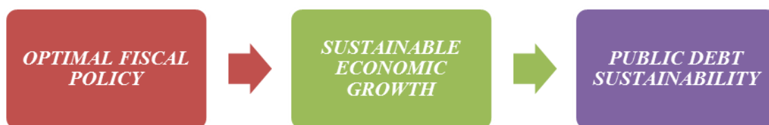
Figure 1: The relationship between fiscal policy – economic growth – the sustainability of public debt

Fiscal policy should directly contribute to ensure a sustainable economic growth that will further ensure sustainability of public debt (see figure 1). Angelo Baglioni and Umberto Cherubini analyzed the sustainability of public debt of Italy, in the '80s, using the theory of intertemporal budget constraint, and concluded that fiscal policy has not been following a sustainable path in the 1980s [2].